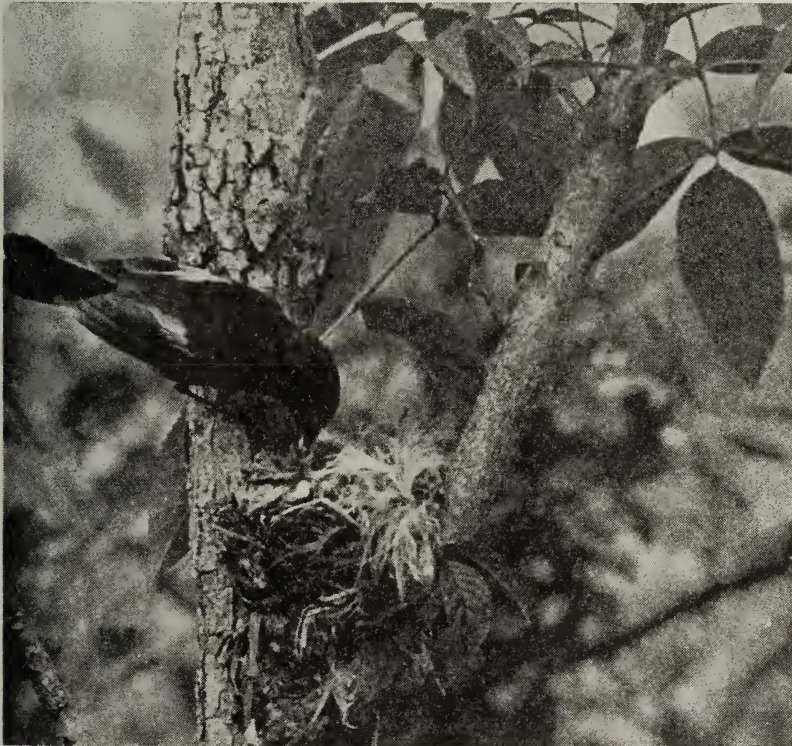
Figure 2. Mature male Redstart feeding young at Nest 4.

During rain the female extends her wings over the sides of the nest, with the head held straight into the air. The female at Nest 2 always continued to brood in the empty nest during the time (about five minutes each day) that I was photographing and weighing the young.